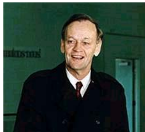
Jean Chretien's Liberals win the federal election