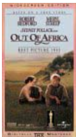
"Out of Africa" wins Oscar; Meryl Streep butchers Danish accent