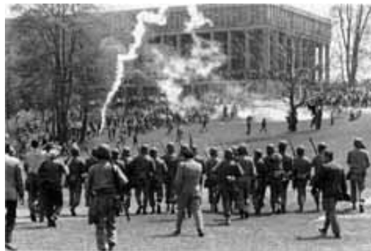
On May 4th, 1970, U.S. National Guardsmen opened fire on students demonstrating against the war in Southeast Asia at Kent State University in Ohio. The National Guard began shooting after some of the students threw rocks. More than 60 shots were fired and when the dust had settled four students were dead and nine wounded. Seeing American troops firing on American students was shocking and led many otherwise patriotic US citizens to rethink their views on the war.