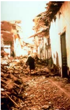
On May 31, 1970 at 3:23 p.m., a magnitude 7.8 earthquake in Peru killed 66,794 and left more than 400,000 homeless.