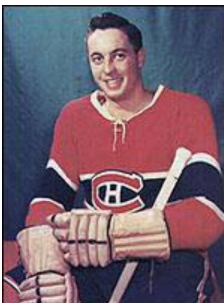
Jan. 23, 1956: Montreal's Jean Beliveau becomes the first hockey player to make the cover of Sports Illustrated magazine

Through heroic recue efforts, primarily from the Ile De France, 1662 passengers were saved. The other 52 died on impact.