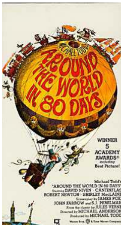
"Around the World in 80 Days" wins Best Picture Oscar

Willie Mosconi sinks 150 consecutive balls in a billiard tournament